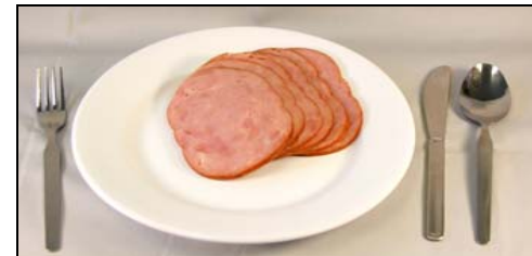
Large (9 ounces)