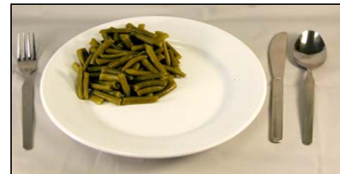
Large (1 1/2 cups)