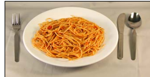
Large (2 1/2 cups)