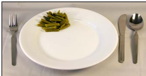
Small (1/3 cup)