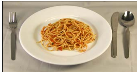
Medium (1 1/2 cups)