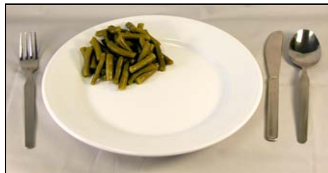
Medium (3/4 cup)