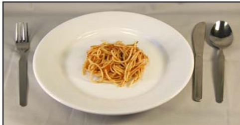
Small (3/4 cup)